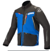
ALPINESTARS VENTURE R JACKET