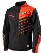
KTM RACETECH GEAR JACKET