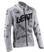
LEATT GPX 4.5 MX JACKET