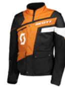
SCOTT 350 ADV JACKET