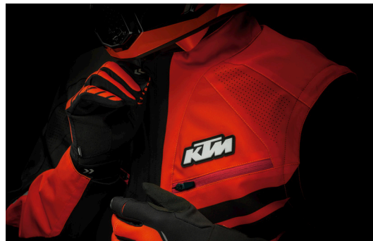
PERFORATED VENTILATION ZONES