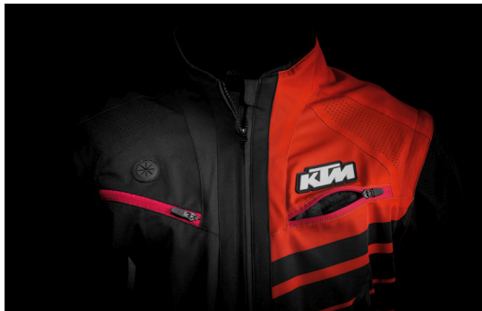
FRONT AND REAR AIR INLETS

PROTECTOR POCKETS FOR OPTIONAL PROTECTION